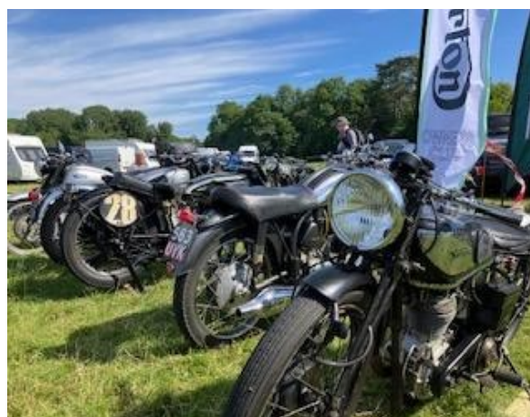
Right A nice selection of OHC Nortons